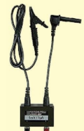
8302 Adapter for recorder (Output 1mV/1μA)