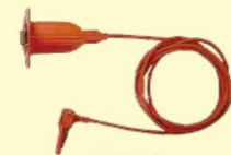
7168A Line probe with alligator clip(3m)