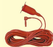
7253 Longer line probe with alligator clip(15m)