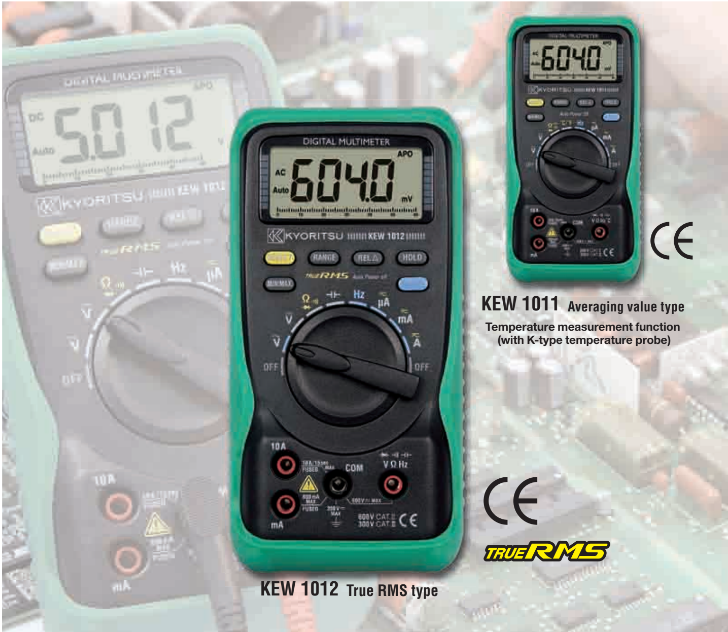
KEW 1012 True RMS type